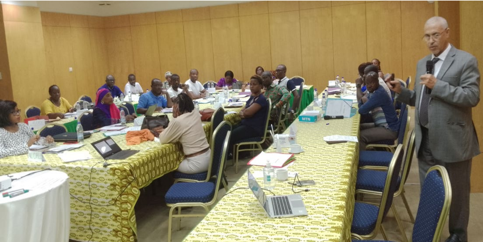
Data quality assessment training workshop at the central level.

With the successful implementation of the data quality assessment tools, the National Malaria Program, as a Global Fund recipient, is using this funding to conduct the data quality assessment of non-USAID-supported regions and districts. With funding from the Global Fund, PMM coached the PNL and DIIS to train and conduct these data quality assessments in non-USAID-supported regions and districts. With these data quality assessment tools, including the MRDQA, the Ministry of Health was able to conduct assessments in the country's districts and health centers.