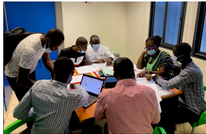
Agboville district data desk review meeting facilitated by PMM.