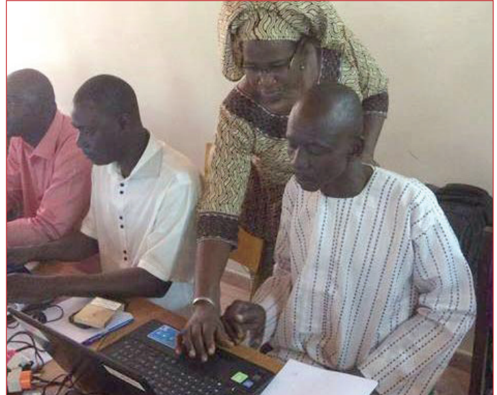
The epidemiological surveillance manager in the Kayes region helps a participant complete practical disease notification exercises in DHIS 2.

To address these issues, the Global Health Security Agenda (GHSA) has stepped in to help Mali strengthen its surveillance system so it can better manage and respond to possible epidemics, such as Ebola. GHSA was launched in February 2014 to help make the world safe from infectious disease threats; to bring together nations to make new, concrete commitments; and to elevate global