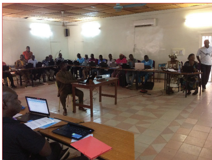
DHIS 2 training in Kayes